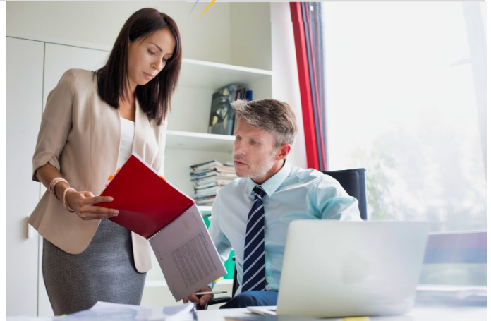
SiteAudit OnSite provides the hybrid workplace complete fleet management to reduce cost & improve service performance.