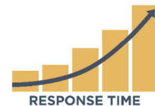
ServiceNow with SiteAudit supplies and counter data